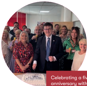
Celebrating a five year contract anniversary with the PeoplePlus team in Scotland