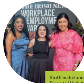
Staffline Ireland, Irish News Best Place to Work Award winners