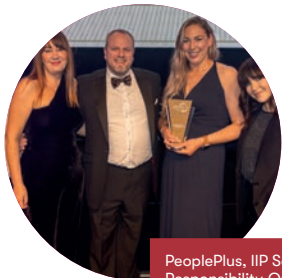
PeoplePlus, IIP Social Responsibility Organisation of the Year Award winners